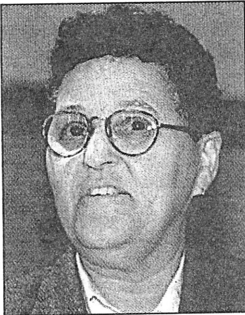
By Clint Steib

The national survey does not include questions about sexual Continued on page 25